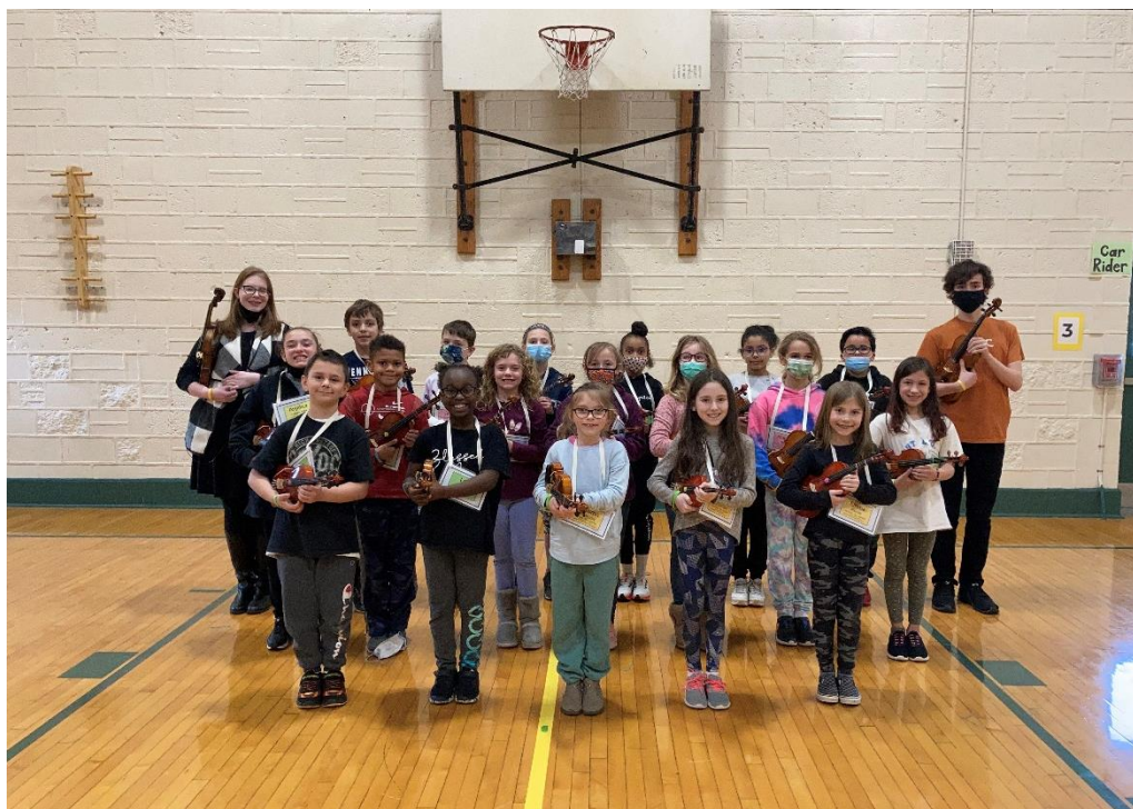
THE BRECHT PTO: VIOLIN PROGRAM - (CLASS OF SPRING 2022)